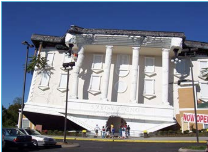
From the world of Wacky Houses; Wonderworks (Pigeon Forge, TN, United States)

“Ask the realtor if we can list the litter box as a third bathroom.”