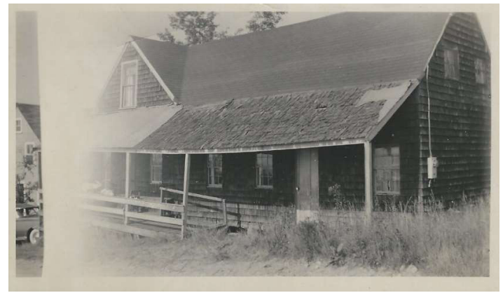
This a photo from around the time my grandparents acquired the camp at Lookout Point.

Before you accuse me of being compassionless, quite the opposite is true. My grandparents owned a camp not unlike many families during the midcentury. My grandfather was a plumber (an ironic turn as my mother would tell it - the house she grew up in was the last in town to have an indoor bathroom) and in 1946 did a job for a man, who, in lieu of payment, ofered the deed to a rundown shack at Lookout Point in Harpswell. The cottage was originally a boarding house, built around 1850. My grandfather, Topsham born and raised, asked that the cottage be deeded to my grandmother. My grandmother was raised in Harpswell, her family had lived there for generations. Her ancestors' remains litter the Harpswell churchyards and cemeteries from the Neck to Cundy's Harbor.