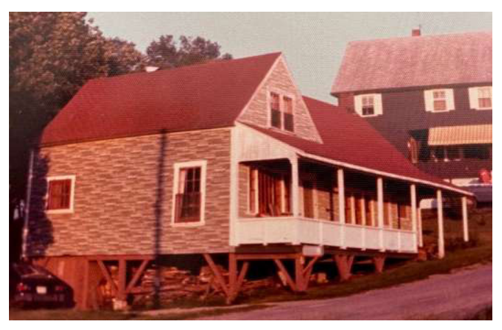
This is a photo of the camp just before it sold in 1984.

On lazy days, we would sit in porch rockers and watch both tourists and locals drop by the commercial dock to purchase fresh seafood of the boats (many lobstermen who worked from the dock were second and third cous-