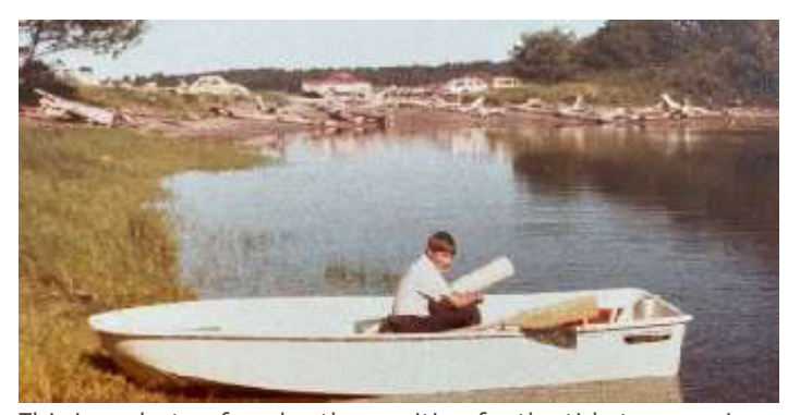
This is a photo of my brother waiting for the tide to come in so we could take the boat out.

My parents, who struggled under the financial weight of raising four children, finally purchased a boat, but it was a 12-foot fiberglass rowboat with no motor. Every time we used it, we had to carry it from the yard to the water. As we got older, we were allowed to take the boat out unsupervised, but my mom would use a bike horn to call us in if we got "too far" from shore, which, bless my mom's heart, was usually not "far" at all.